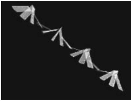
FIG. 1. Consecutive images from a video of a thin card tumbling counter-clockwise through air. The card dimensions are approximately 75 \text{ mm} \times 15 \text{ mm} \times 0.1 \text{ mm} , the density of the card material is 1.34 \text{ g/cm}^3 , the tumbling frequency is approximately 15 \text{ Hz} , and the individual images are 1/60 \text{ s} apart. The apparent changes in the dimensions of the card are illusions of perspective.

of behavior: (a) two equilibria corresponding to the card falling in its (stable) broadside-on and (unstable) end-on configurations, (b) a solution that connects these equilibria guaranteed by the periodicity of the angle characterizing the orientation of the card, and (c) a means of bringing the two equilibria together as some parameter such as w/d or the drag coefficient is changed. This last ingredient is where the individual models differ; however they all lead to a saddle-node bifurcation 16 beyond which only the tumbling mode is stable. 17 Since studies focusing on the flutter-tumble transition alone do not characterize the physics completely, we have experimentally probed the tumbling of strips far from this transition.